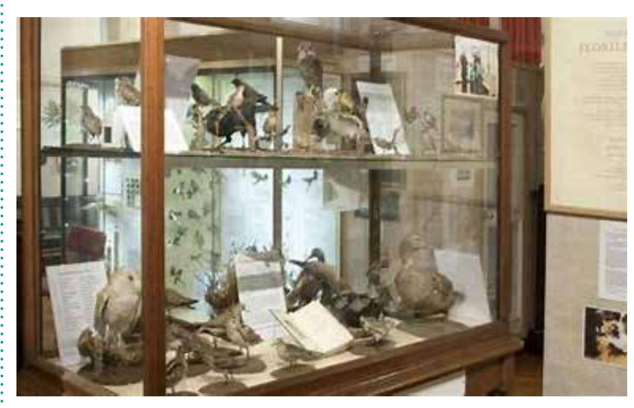
Eton College's Natural History Museum