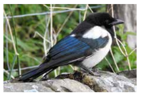
Photo credits: Juvenile magpie, Saffy H, Flickr.com; Pet magpie, Francisco Goya