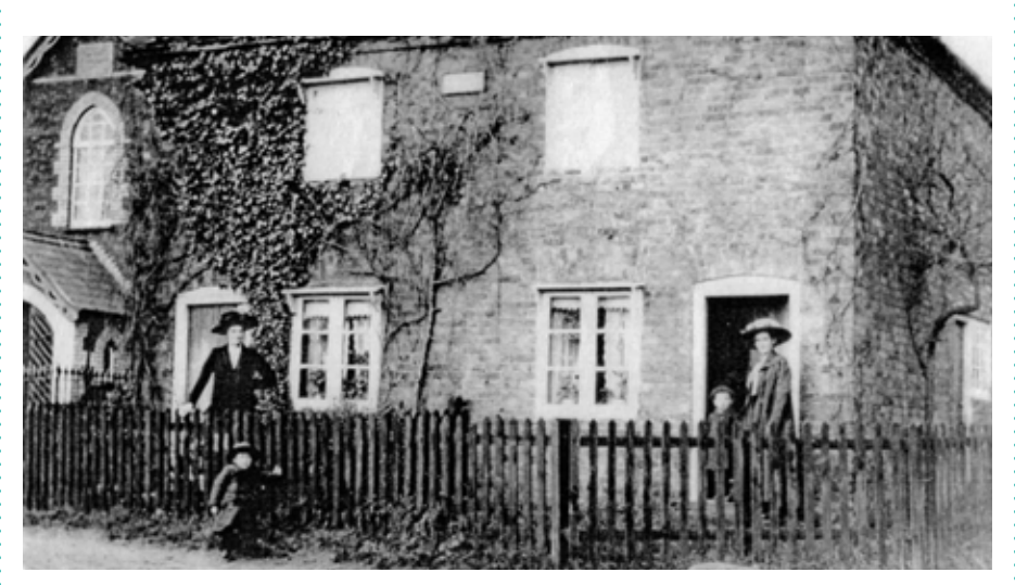
Cottages by Baptist Chapel