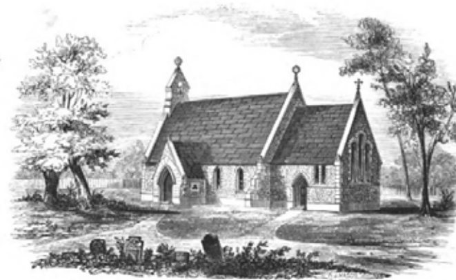
TRINITY CHURCH, SEER GREEN, DUCKS.

In 1986 Jordans became part of the parish with Seer Green, and in 2015 the parish became part of a Benefice with Chalfont St Giles.